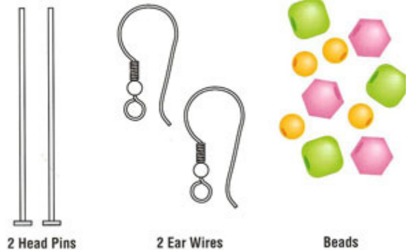
2 Head Pins