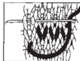
Swiss Darn Broder

Remove cardboard and wind yarn tightly around loops ¾ inch [2 cm] below fold. Fasten securely. Cut through rem loops and trim ends evenly. Attach to corners of blanket. Swiss darn eye using MC as illustrated.