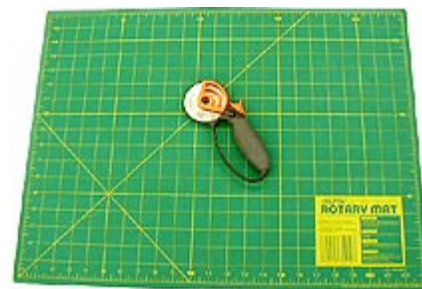
Rotary Cutters / Cutting Mat