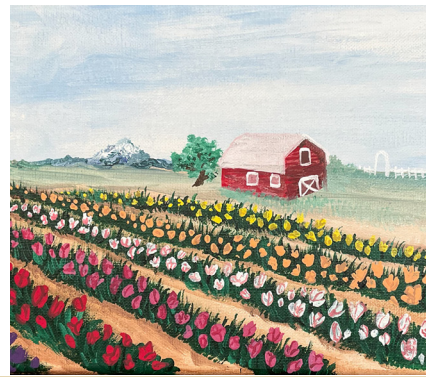
Watercolor / Acrylic Painting