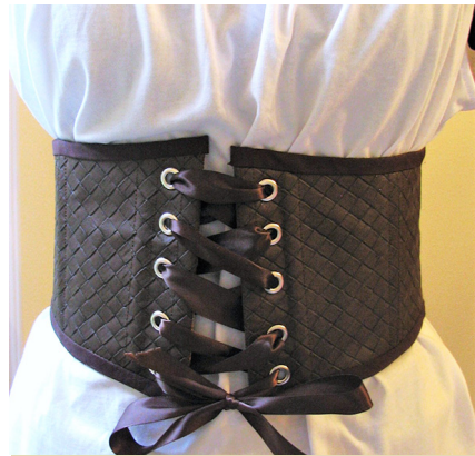
Sewing / Quilting