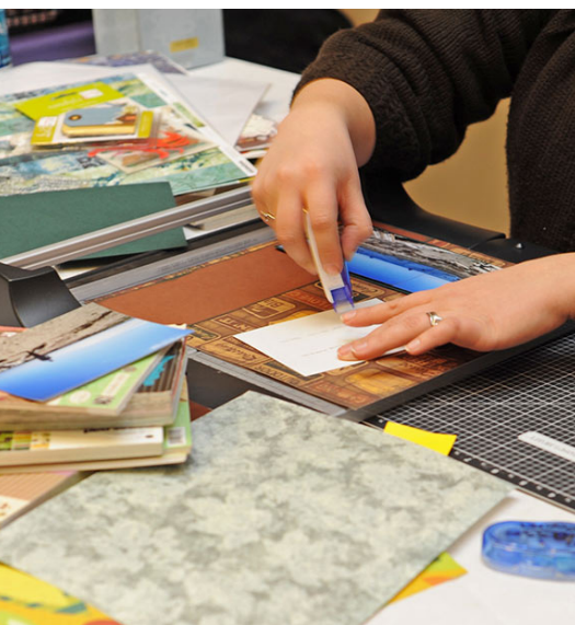
Scrapmania | Sat. May 11