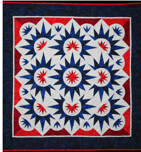
Sewing / Quilting