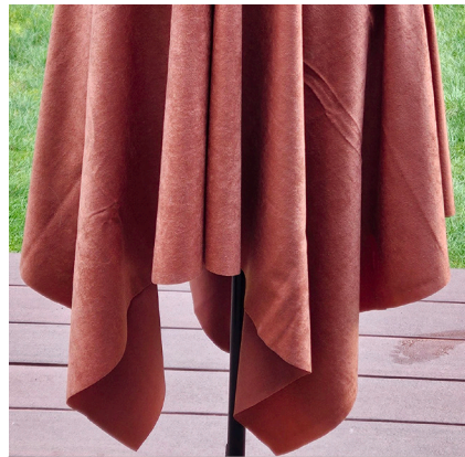
Sewing / Quilting