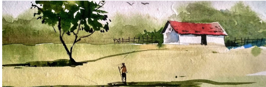
Watercolor / Acrylic Painting

We're so grateful to have you in our creative community!