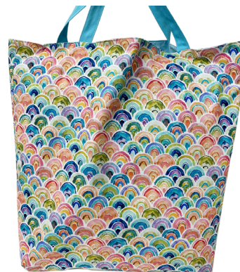
Sewing / Quilting