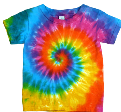
Tie Dye Workshop