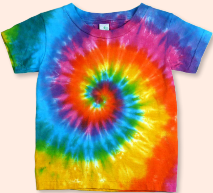
Tie Dye Workshop | Fri. July 25

Learn the skills, meet the people, and walk away with something you're proud of.