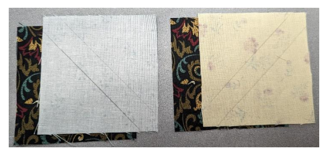
I chain pieced all of my fabric sets at once.

Draw a diagonal line (or lines) on the backside of fabrics \mathsf{D} and \mathsf{F} . Pair them with a fabric \mathsf{E} and sew on the lines.