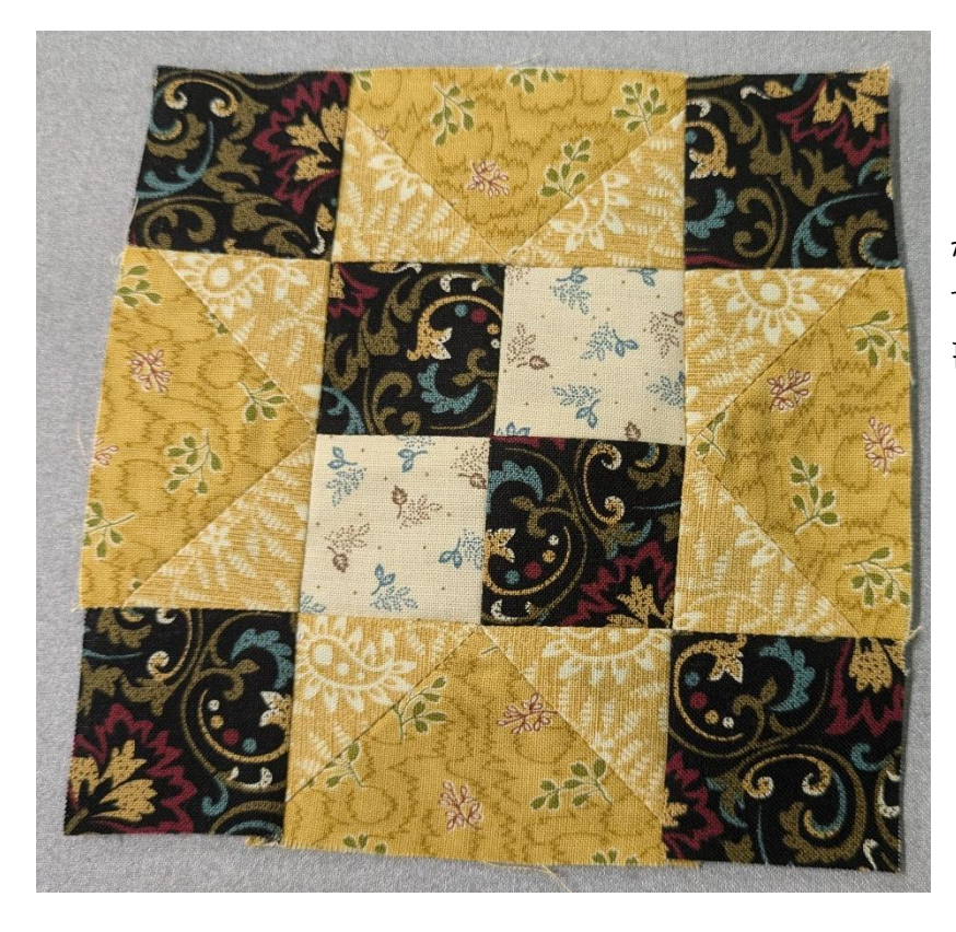
Assemble the center block. Trim to the size specified in your pattern. Press your seams open.