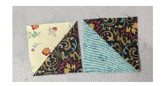
Cut apart, press towards fabric E. Trim.