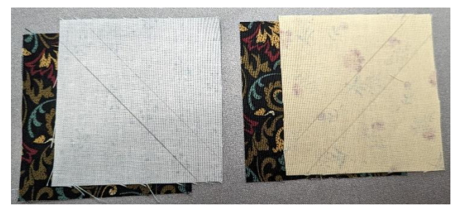
I chain pieced all of my fabric sets at once.

Draw a diagonal line (or lines) on the backside of fabrics D and F. Pair them with a fabric E and sew on the lines.