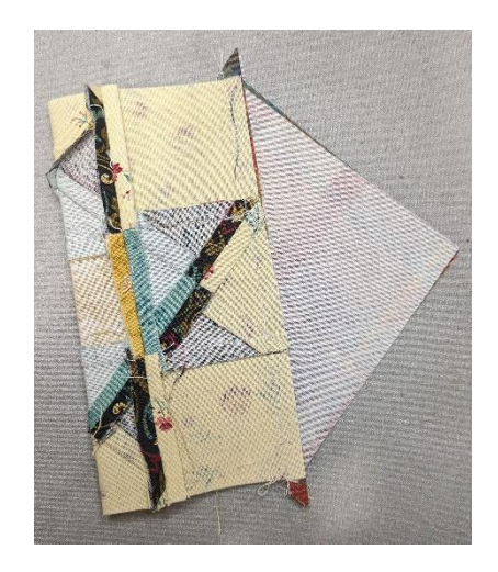
Fold again and sew the remaining sides.