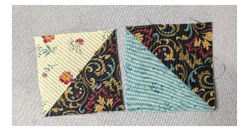
Cut apart, press towards fabric E. Trim.