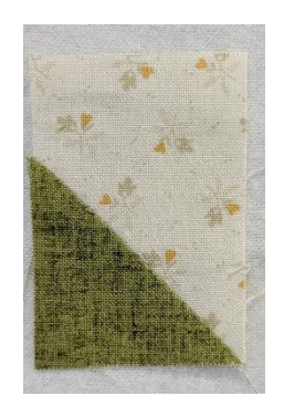
Repeat for the remaining leaves.