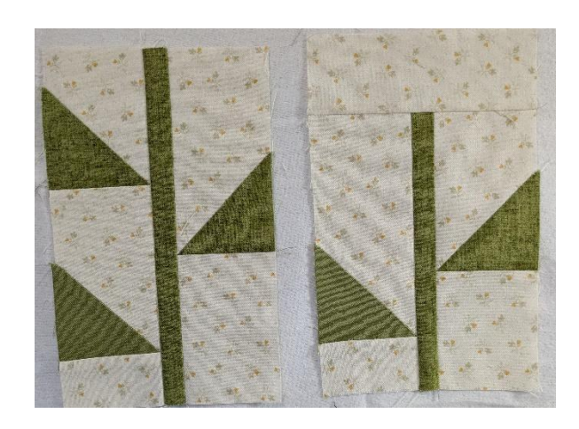
Step 4 Assemble your flowers and sew your flowers rows together.