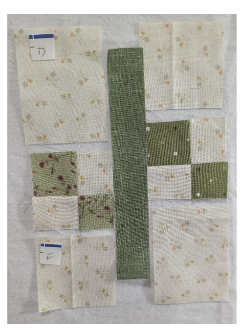
Step 4 Assemble your stem units

Press in opposite directions according to your pattern. I found my stiletto to be helpful here as well as my best press/flatter spray.