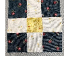
Make 2 large and 1 small 9 patch flower set.